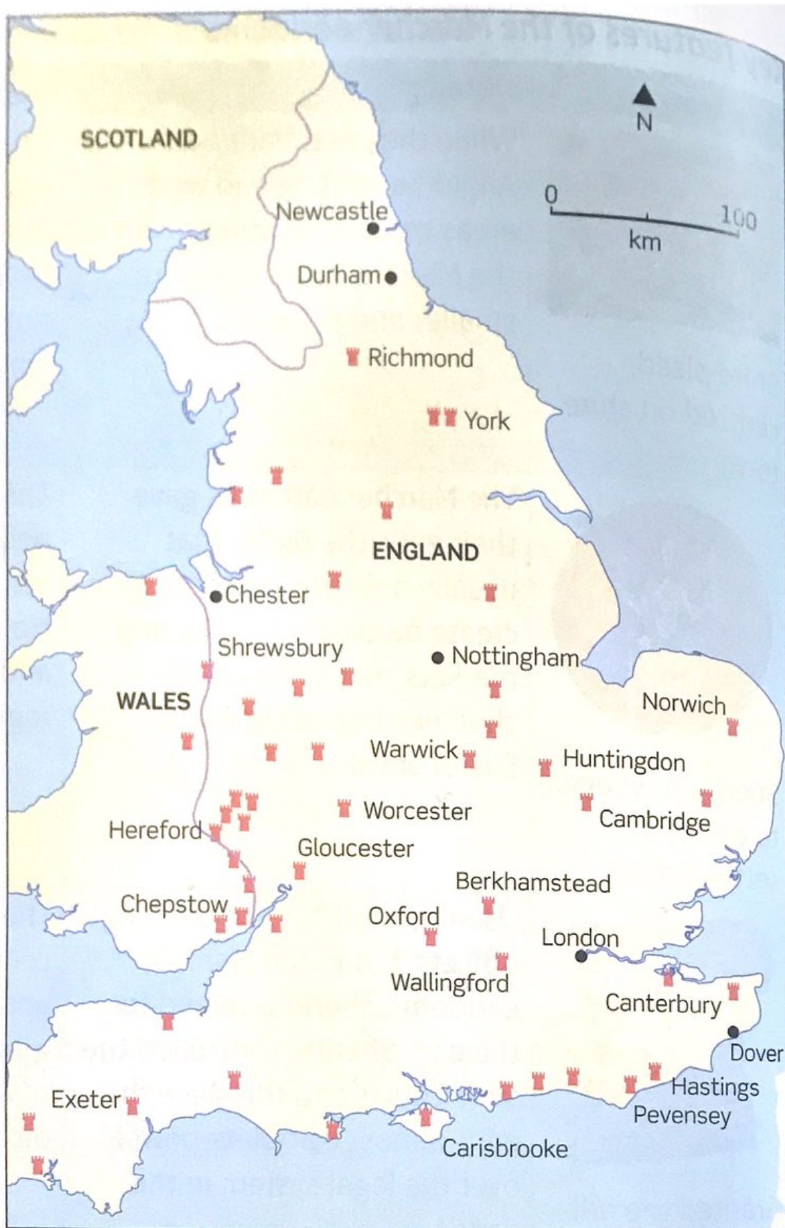
Figure 2.3 This map shows the location of the most important castles built during William's reign.